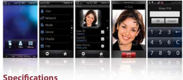
Intuitive Touchscreen GUI of BioStation T2